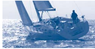
Sun Odyssey 39 DS Performance