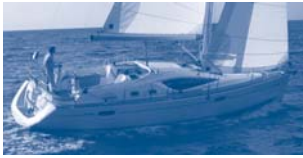
Sun Odyssey 39 DS