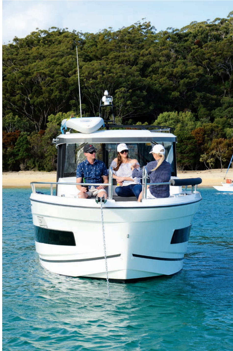
CLOCKWISE FROM LEFT The Merry Fisher converts easily into an entertainer; The smooth lines allow you to pack all the toys; It is not designed as a high-speed boat but cruises beautifully